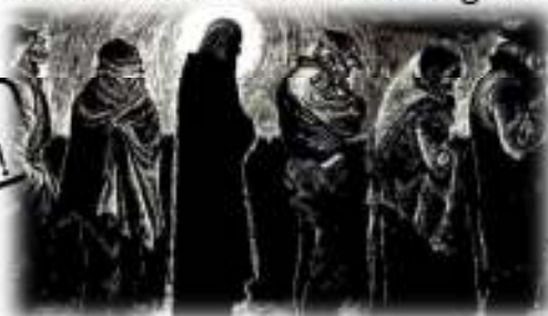
Christ of the Breadlines (1900) wood engraving by Fritz Eichenberg

This year's GIFT theme is "Acting for Justice"