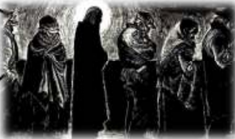
Christ of the Breadlines (1950) wood engraving by Fritz Eichenberg